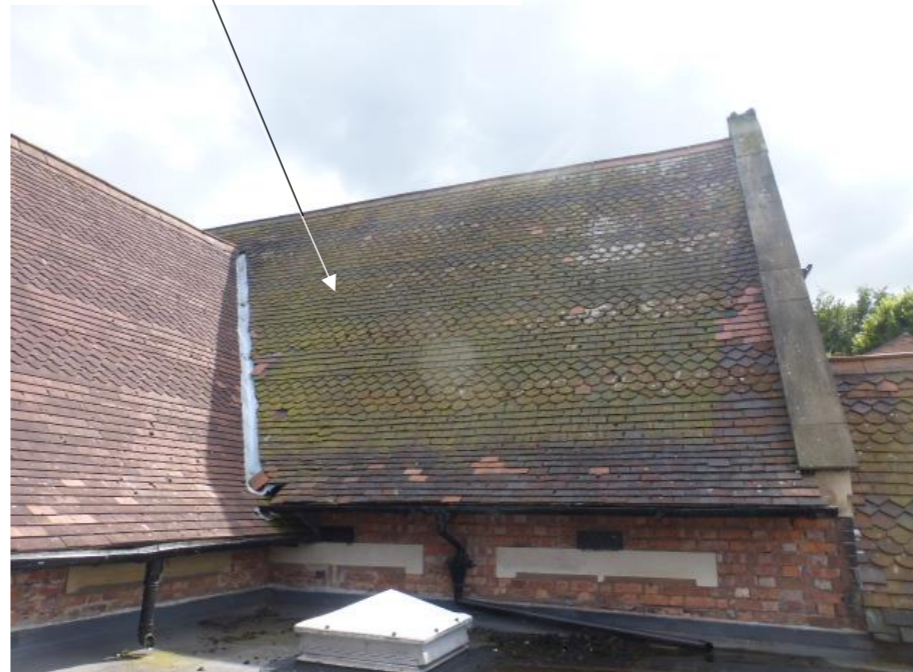
Main rear roof slope at West end of building, showing patch repairs & slipped tiles