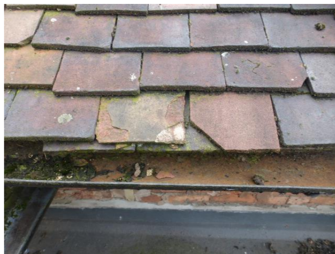
Cast iron gutter and broken and spalling roof tiles