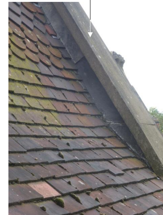
Parapet wall at West end of building

Existing stone coping blocks are to be removed to allow lead flashings to be replaced. The copings are to be replaced using stainless steel restraint angles in the joints as per SE detail