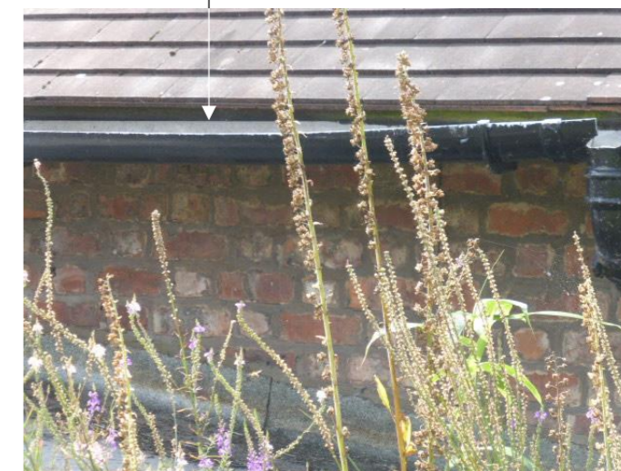
Deflected gutter above main flat roof area

Gutters are to be cleaned out and all support bracket fixings are to be checked and repaired as necessary. Provide and fit matching brackets as required, to re-align the gutter