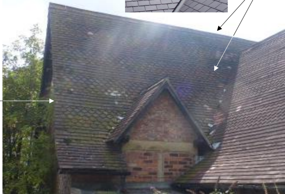
Main rear roof slope and dormer at East end of building showing patch repairs

The gable end roof overhang is to be under-boarded using 18mm T & G boards painted black and an under-cloak board is to be provided under the overhanging edge tiles to allow pointing to the tile edge