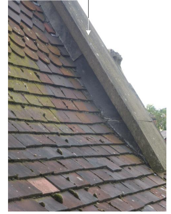
Parapet wall at West end of building