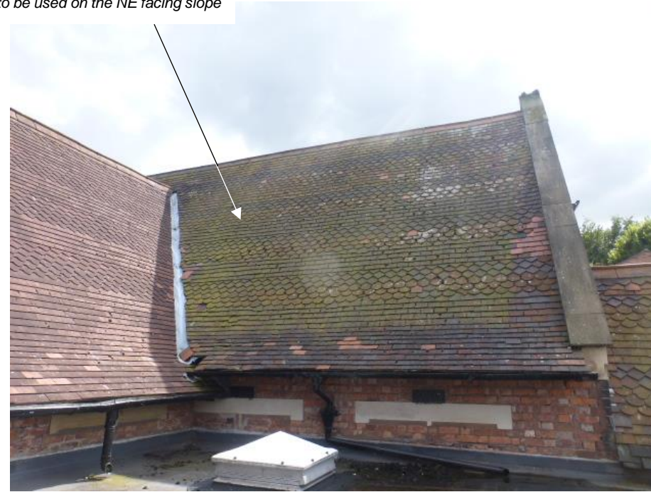
Main rear roof slope at West end of building, showing patch repairs & slipped tiles