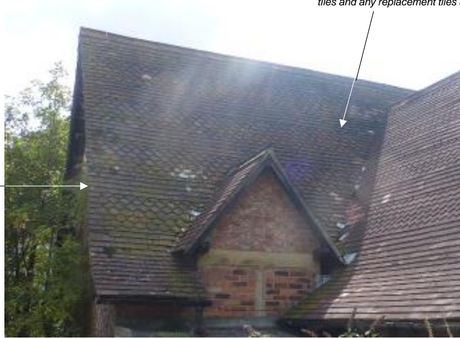
Main rear roof slope and dormer at East end of building showing patch repairs

The gable end roof overhang is to be under-boarded using 18mm T & G boards painted black and an under-cloak board is to be provided under the overhanging edge tiles to allow pointing to the tile edge