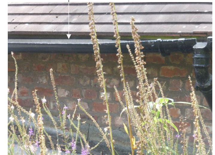
Deflected gutter above main flat roof area

Gutters are to be cleaned out and all support bracket fixings are to be checked and repaired as necessary. Provide and fit matching brackets as required, to re-align the gutter